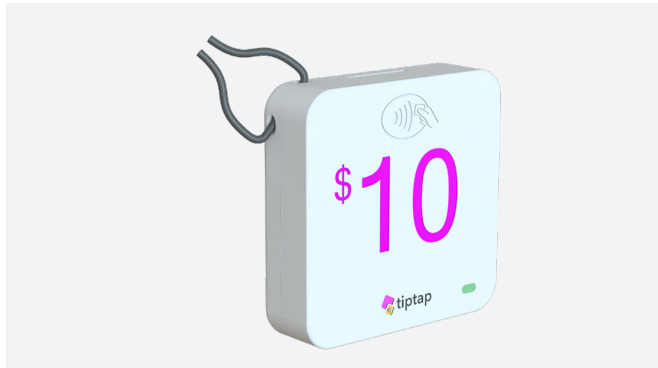
TipTap final version 3D rendering