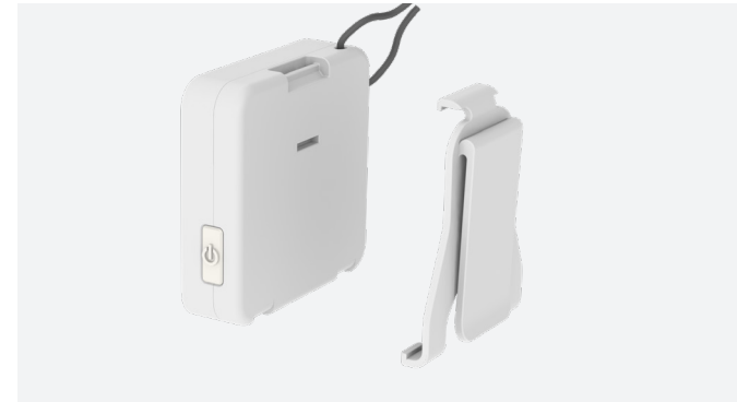
TipTap device with mounting clip