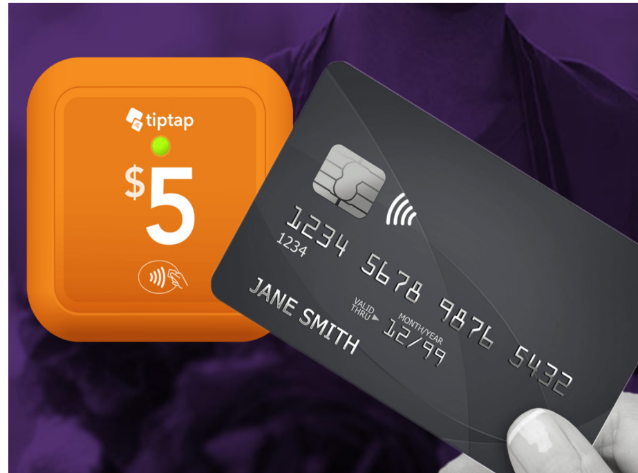
TipTap visual concept

NeuronicWorks was tasked to develop the industrial design, hardware, and firmware of the project. We modified and redesigned the unit, from its prototype phase, for production and usability. From enclosure, light pipe, lanyard mount, and clips, to hardware design, layout and manufacturing, NeuronicWorks worked closely with the client to make sure the final design was production and market-ready.