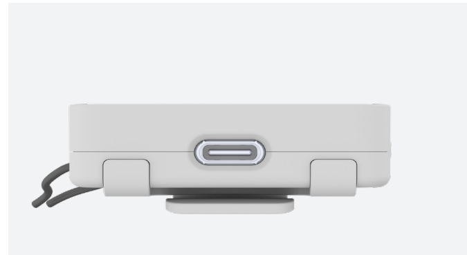
TipTap mounted side view